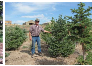
Typical b&b project: 5 trees 8' tall, good, = $320/ tree + $225/tree planting = $545 each.

Tree Cost + Moving Cost = PLANTED TREE COST